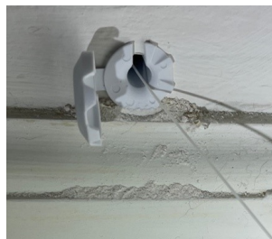
FIGURE 2: Close-up of InvisiLight Cord through wall grommet.