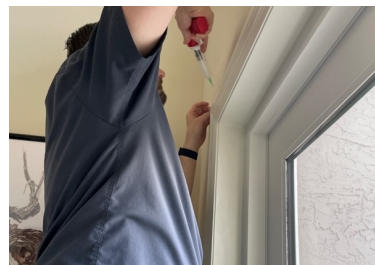
FIGURE 3: InvisiLight adhesive installation on top of door frame.