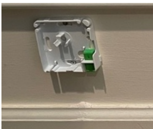
FIGURE 1: InvisiLight module location behind a dresser.