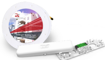
InvisiLight® MDU Cord and Compact Point of Entry Modules (in Risers and Hallways)