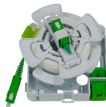
InvisiLight® ILU Solution (in Living Units) 900 & 600 μm Versions